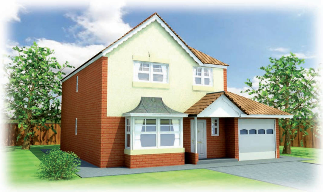
This is a computer-generated image of a typical Winchester house. External specification, finishes and landscaping may vary from plot to plot. Please refer to sales negotiator for further details.